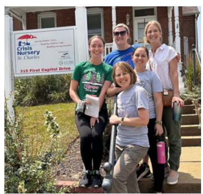
Ladies with Mercy Kids spent the day with us! What a treat, they were amazing with the kids and so helpful! They made a huge recycling run for us and helped to make our space neat and tidy. We can't thank them enough!