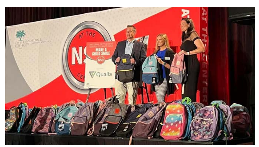
We are so grateful to be the recipient of the 2023 "Make a Child Smile" at the National Settlement Services Summit (NS3) that was held in Saint Louis this year! October Research raised enough money to create over 300 backpacks full of supplies for our kiddos! Thank you so much for providing the necessities to set kids up for success this upcoming school year!